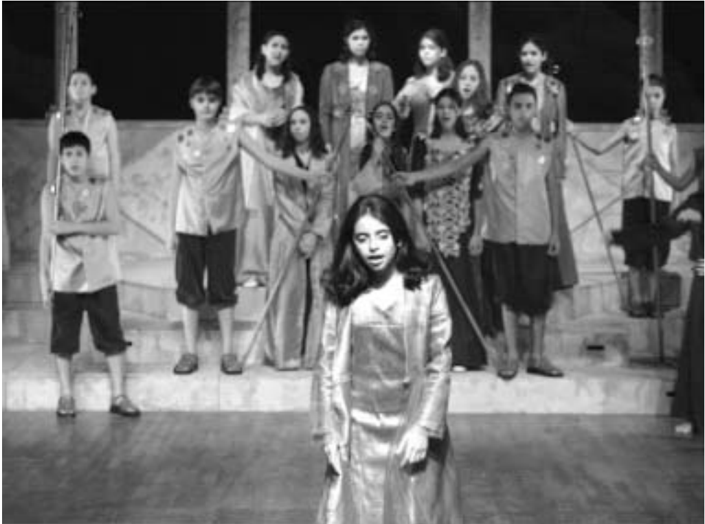
A scene from Fawanees, a children's musical performed in Ramallah, August 2004, in cooperation with the Edward Said National Conservatory of Music.