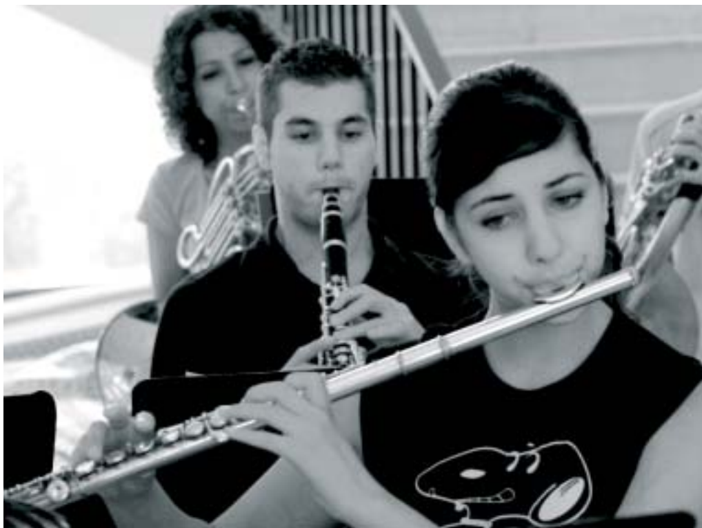
The Palestine Youth Orchestra in Jerash, Jordan, August 2005.

been scattered all over the world... We hope that by performing together as a national orchestra we bring a new face to the Palestinian struggle.” 14 The logistics of such an endeavour require that musicians from many countries gather to rehearse and perform. Initially, the orchestra is meeting in Amman, Jordan, to ensure fewer problems securing visas and obtaining permission to move.