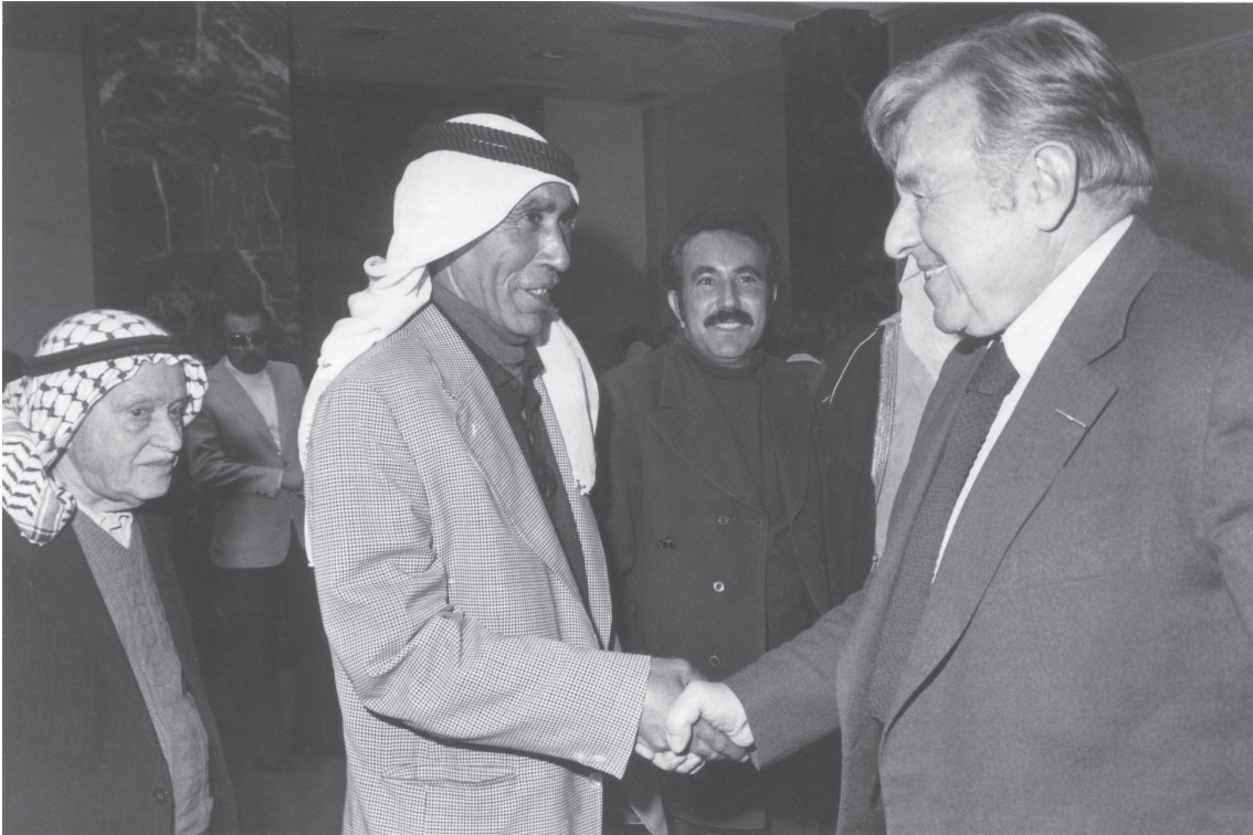
The mukhtar of Jerusalem's Gypsy community meeting with the new Israeli mayor of Jerusalem, Teddy Kollek, in 1968.

While there are photos of Gypsy performers in Jerusalem in the early twentieth century, today this stereotypical Gypsy profession has all but died out. In Gaza, too, Gypsy entertainment has apparently ground to a halt. "The Gypsy ladies no longer dance. [It] would be a sacrilege to have a celebration while the Palestinians are being killed by the Israeli army," one ex-dancer told a reporter. 33